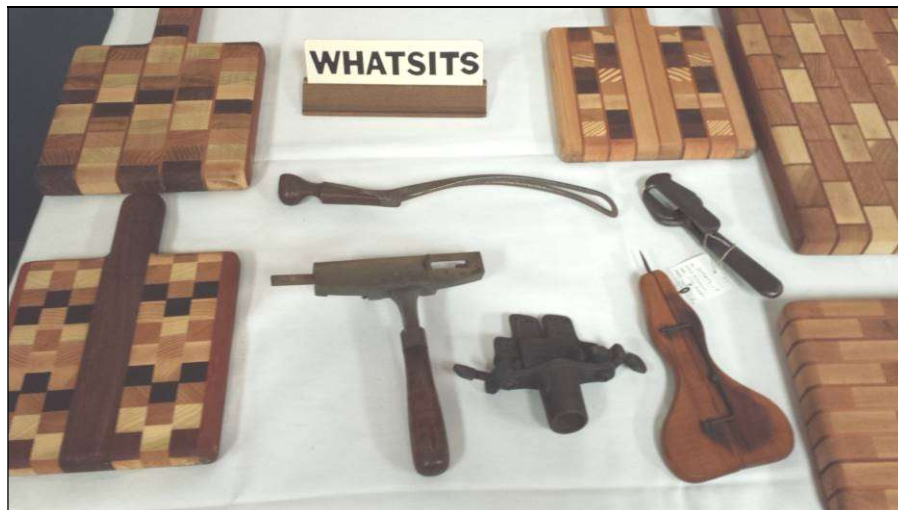
What's It Table items

Reid O’Connell – Reid is a small, diversified collector with tools of every trade, including rules, wooden handled things and hand corn planters. His prized item is a grain cradle, which was used for manual grain harvesting.