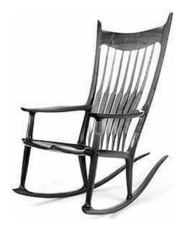
Above: Maloof's carved seat walnut rocker that made him furnituremaker to the presidents